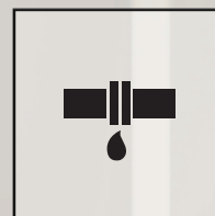
Auto Leak Detection